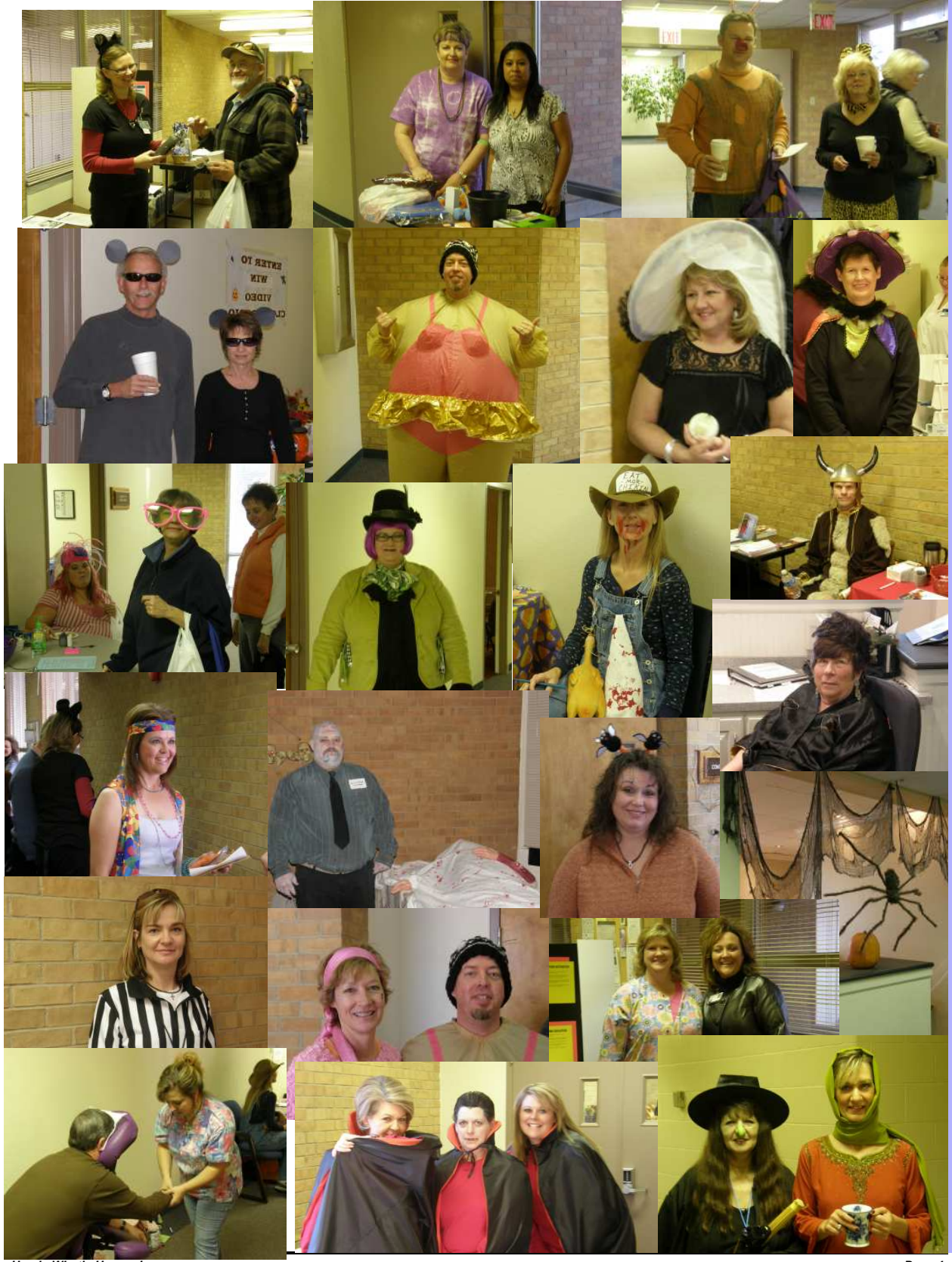
Here's What's Happening